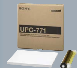
UPC-771 Self-Laminating Color Printing Pack

*1 When compared to the UP-D70XR Model *2 When using the UP-D70XR Model and SCSI interface