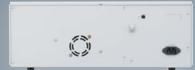
UP-D75MD Back Panel